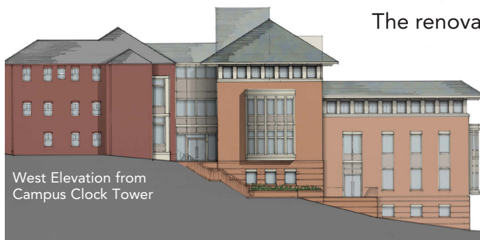
West Elevation from Campus Clock Tower

The campus is home to undergraduate students—largely freshmen and sophomores—and offers a wide variety of academic and student life opportunities. The Women's Leadership Program for first-year women students is based on the Mount Vernon Campus as a signature legacy of the Mount Vernon Seminary and College's commitment to women's education.