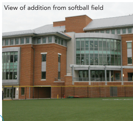
View of addition from softball field

However, with the completion of West Hall (Pelham Hall Redevelopment project) in fall 2010, most of these activities were relocated to the new building, allowing for a complete renovation/expansion of Ames Hall to create a blend of